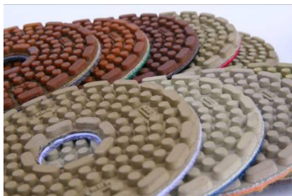
KGS HYBRID® ECO