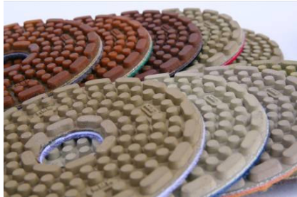
KGS HYBRID® SUPER

The KGS HYBRID range designed to use wet & dry (on natural & engineered stone) now brings an Industrial level tool with the KGS Hybrid Super, giving the longest lifetime in the market, and now also the KGS Hybrid ECO, bringing all the capability of the KGS Hybrid range, but in an economically priced version of the Hybrid technology.