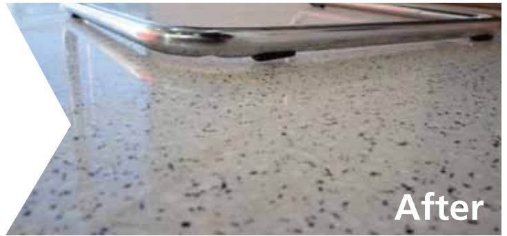
Concrete Terrazzo with the 5 step RENOVATOR™ and 3 FLEXIS® pads system, average gloss level of 92% and a safe slip test result of 132.